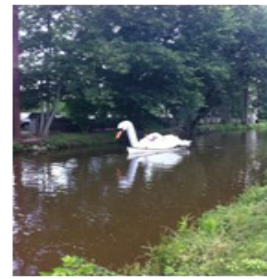
An array of Decorated Boats...